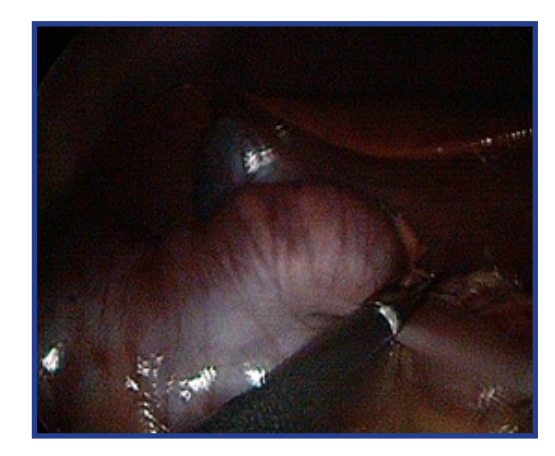
Figure 3. Atraumatic bowel clamp placed out of the distal segment

(Fig 4) An impression found on the terminal ileum, was most likely result of by a peyer's plate. (Fig 5, 6) Appendectomy was routinely performed to avoid possible confusion in the future due to postoperative scars. (Fig 7) Consequently, we performed the attachment of the distal ileum to the ascending colon with several interrupted 3-0 sutures. The infant's postoperative course was uneventful. Oral feeding was started immediately, and he was discharged after 3 days of hospital stay. The ileo-ileocolonic pexie is done with an extracorporeally inserted needle (through the anterior abdominal wall) by placing 2 sutures between the tenia libera of the caecum and the terminal ileum's wall using the technique of intracorporeal knot tied to prevent possible recurrence. (Fig 8, 9)