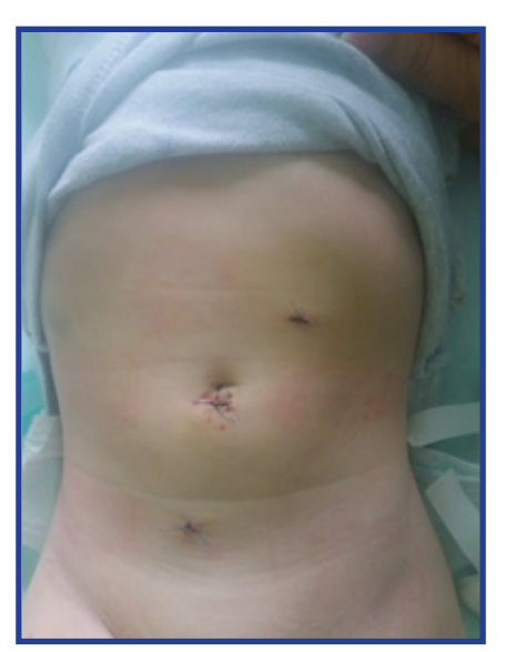
Figure 10 Postoperative wounds

discharged from the hospital after 3 days. On the 8th postoperative day, surgical sutures were removed. (Fig 10).