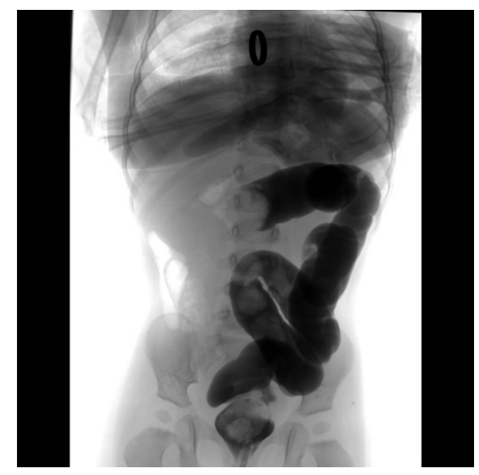
Figure: 1 A barium enema study - contrast passed through the distended sigmoid colon, the distended colon descendens until the middle part of the colon transverse where there was a stop.

the propagation of the contrast content. The contrast could not go further and an attempt at therapeutic radiological desinvagination failed. (Fig 1)